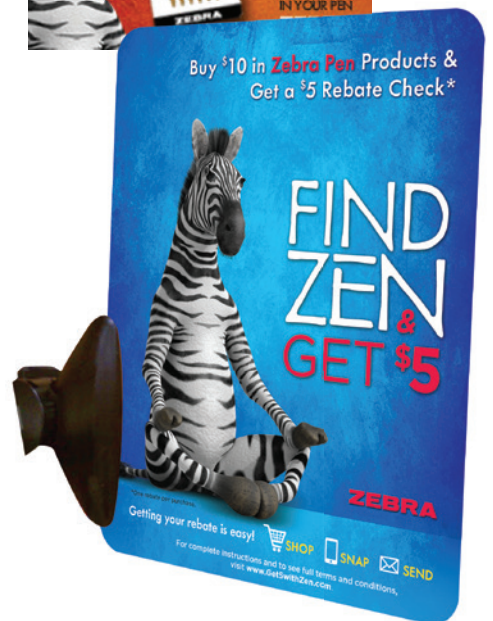
Back to School Campaign: Microsite, On-line Ads, Merchandising