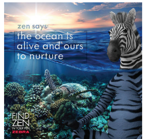
Monthly Featured Header and Sample Social Post Images