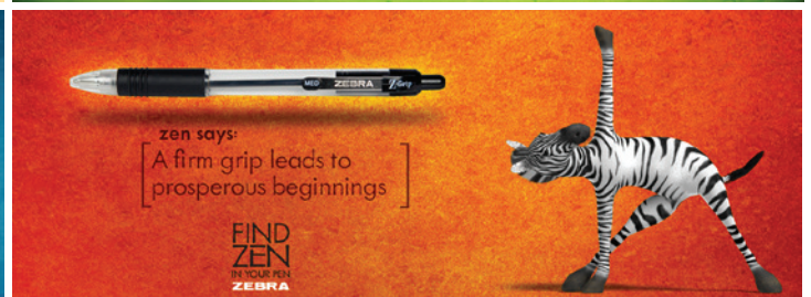
Four Main Sub-Brands with “Zen-isms”